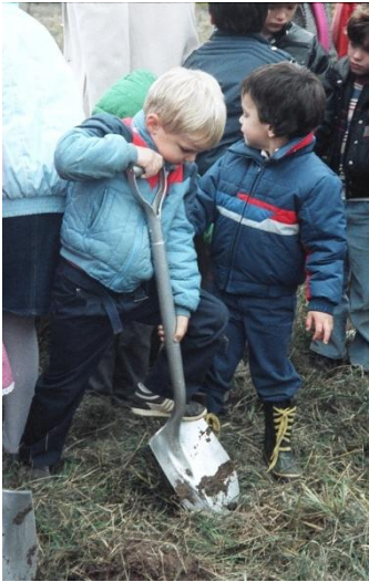
The kids are ready