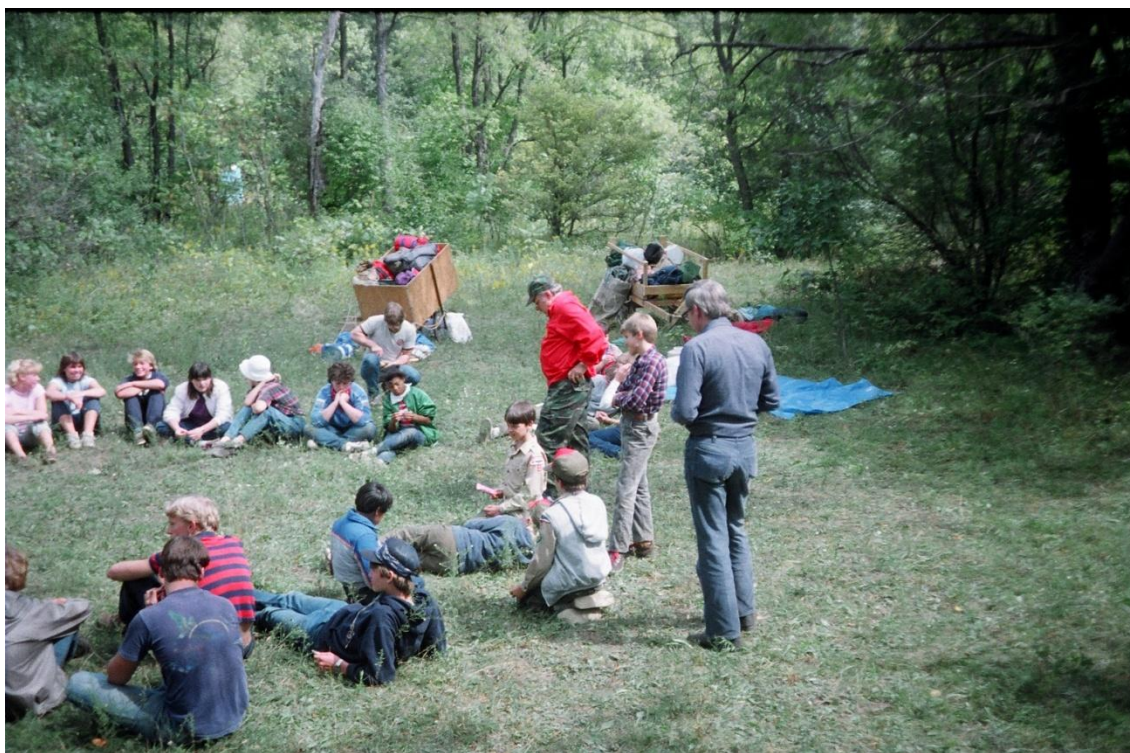
Hmmmmm. More contemplation