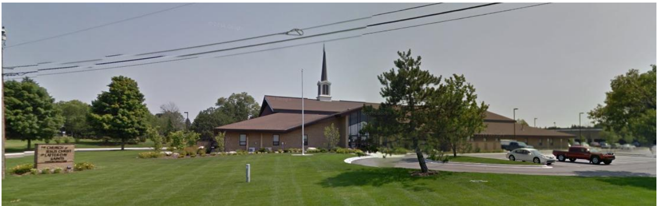
Our new building on Leonard Street. Ground breaking was on October 20, 1985. The first stake conference held in the building was on December 13 & 14, 1986.