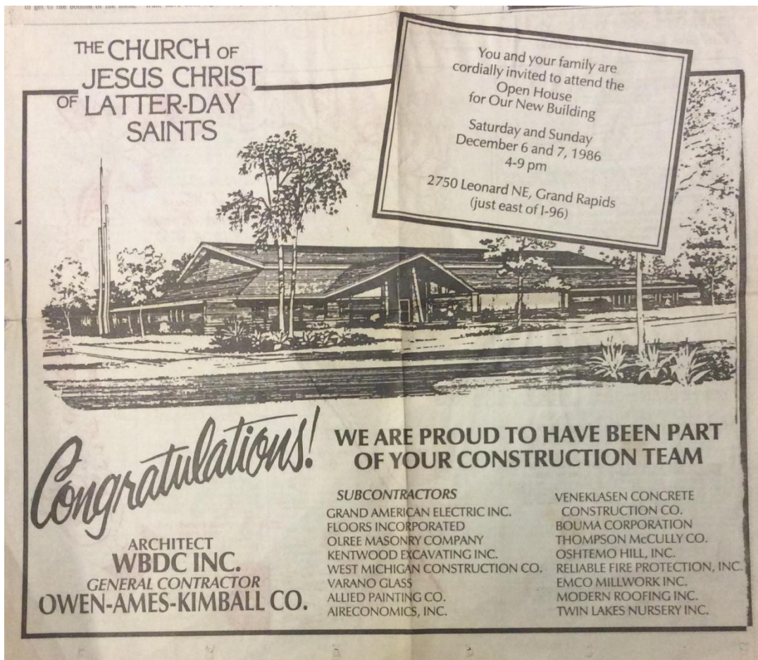
Congratulatory Ad in the Grand Rapids Press