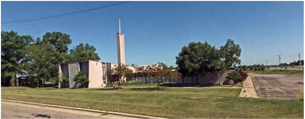
Our old building on Bradford Street. We used it until 1986.