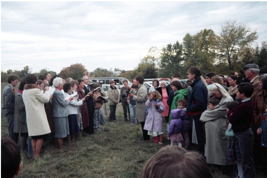
The choir sings