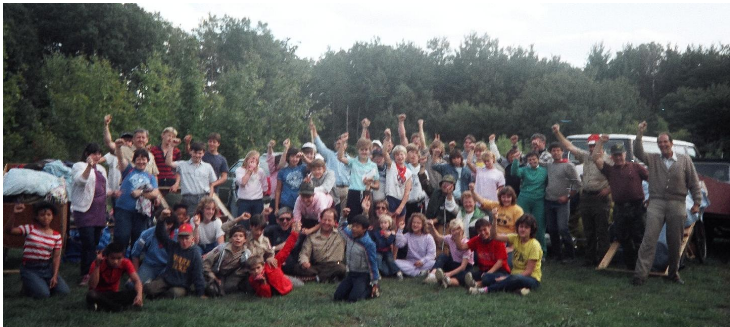
WE DID IT !!