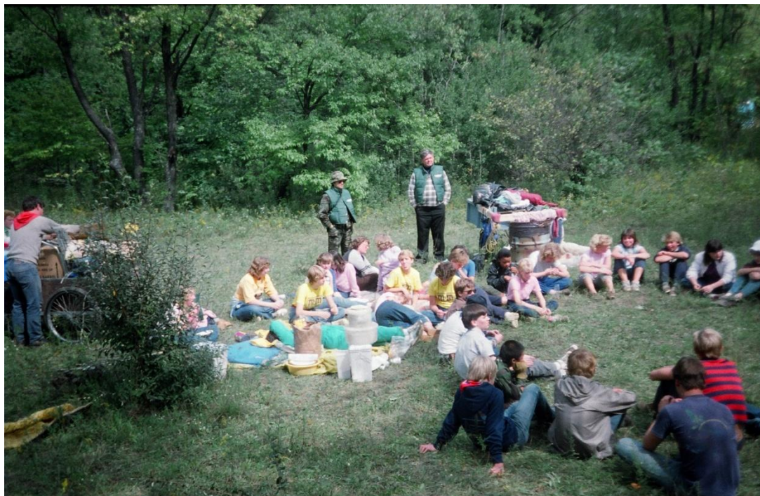
We'd better think this over