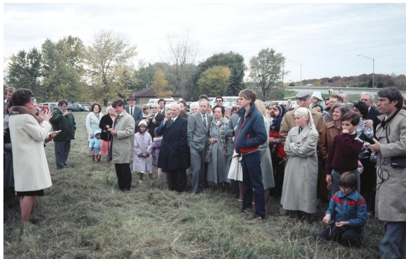
The Audience Listens