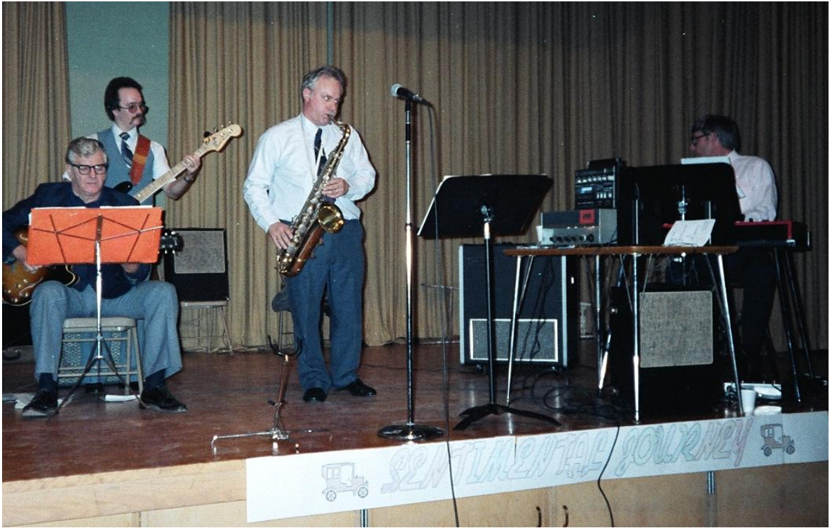
The Merry Melchizedeks Play