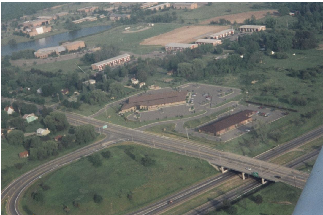
Aerial View of the new Stake Center