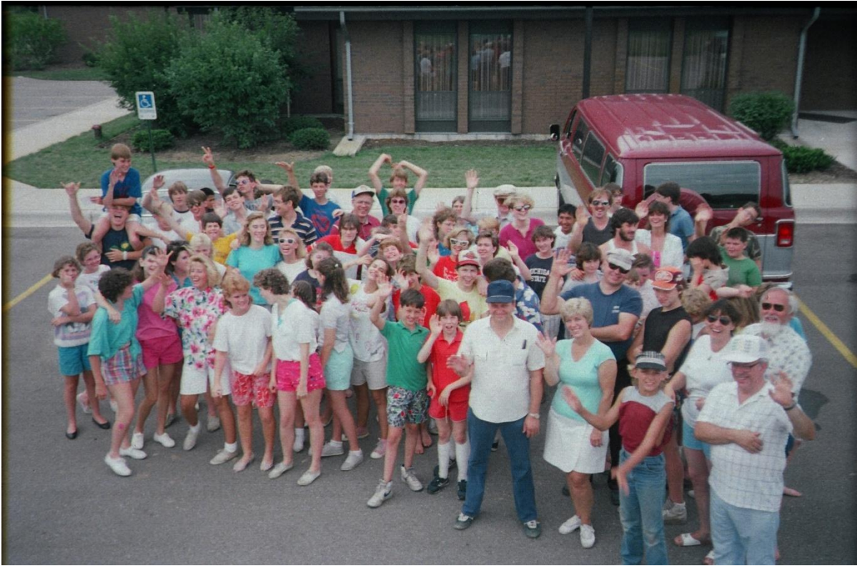
Getting ready for the big splash