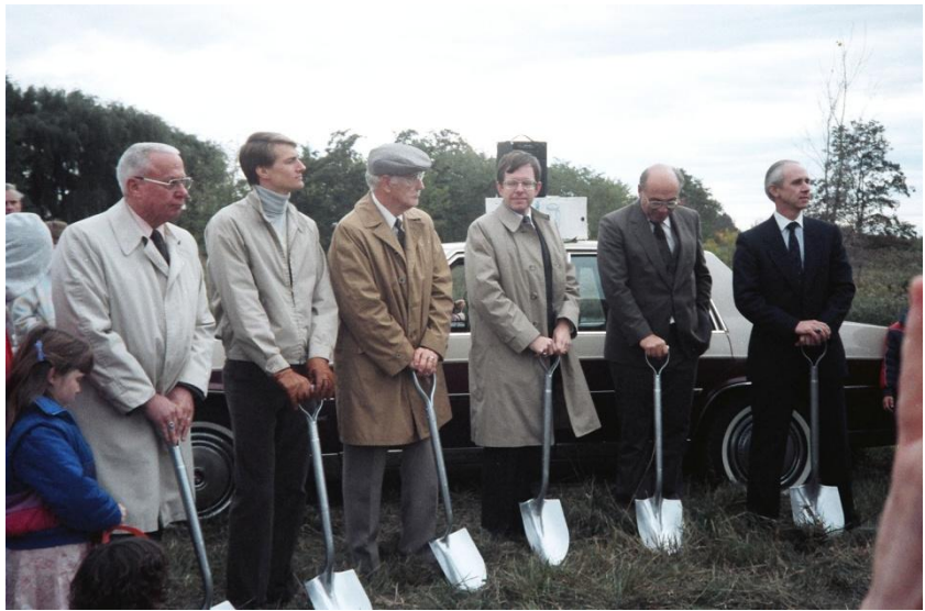
On Your Mark ! Get Set !