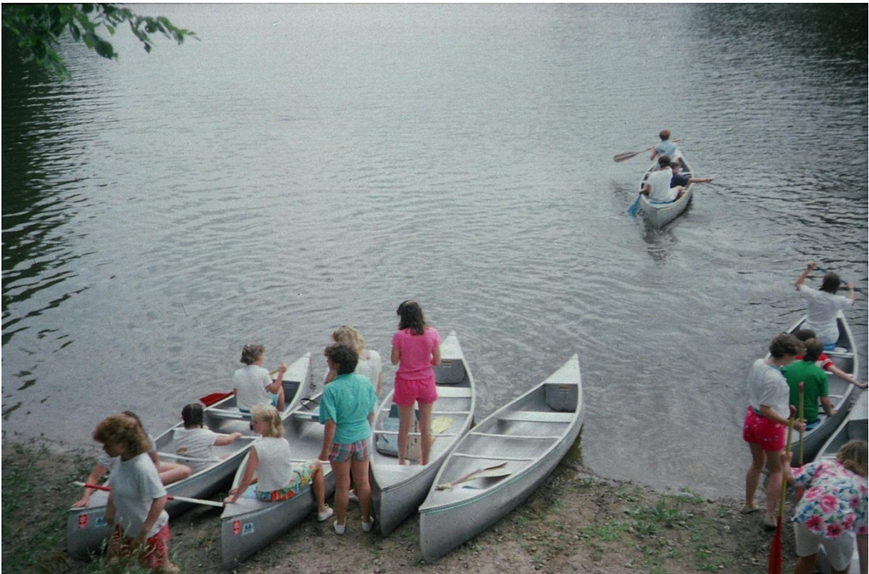
Launching the Boats