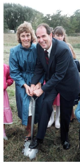
A Team Effort