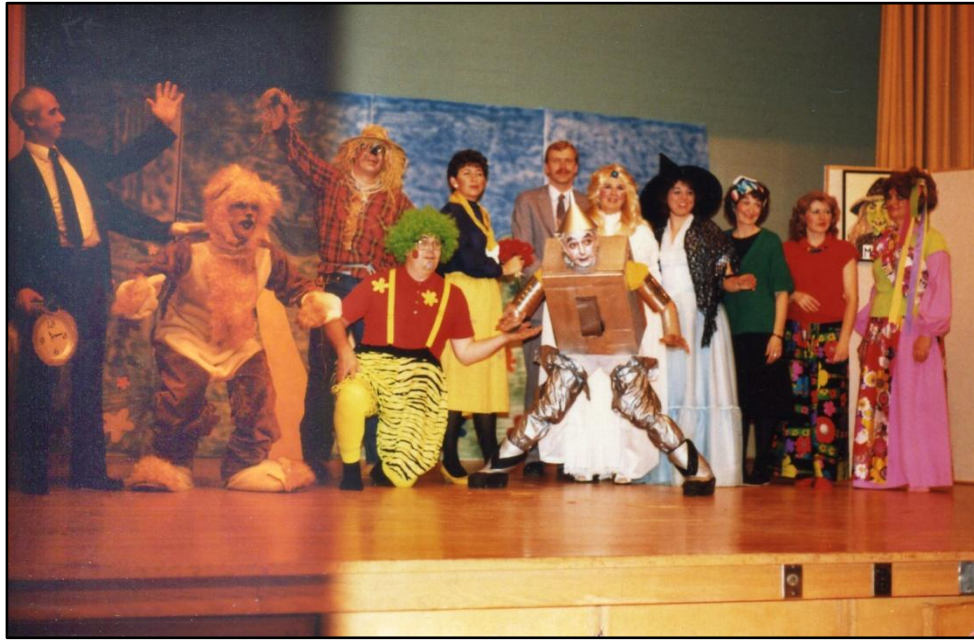
The cast of The Fractured Wizard of Oz

Working with the early morning seminary was another fond memory of Bishop Larkin, particularly presenting a breakfast for them once a month. At first it was quite simple, like toast and orange juice, with which the youth weren't real impressed. They then went all out and prepared a very special breakfast which was much better received, in fact helped to endear the students to the Bishopric and provide some fun and laughs with the youth. There were times when they picked up the students and waited for them so that they then could get them to their respective schools following seminary.