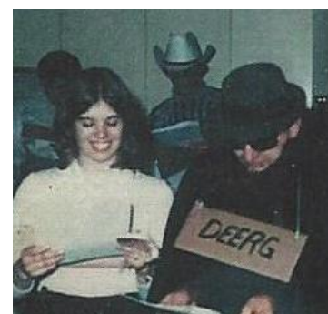
Christmas Play Dec 1978

For anyone acquainted with either the early or current Big Rapids RS sisters, it is no surprise their early initiatives helped anchor the Church in the Big Rapids area.