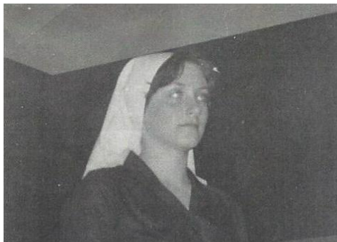
Big Rapids attends a Party and Play at Mt Pleasant, 1976